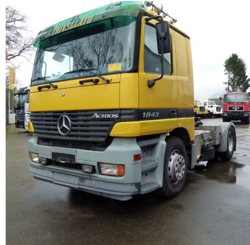
Mercedes-Benz Actros 1843 LS Actros - 4x2