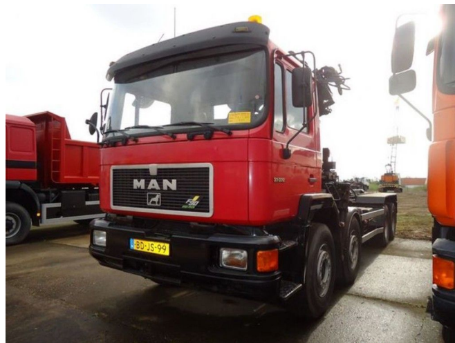
MAN 37.372 8x4 HIAB195