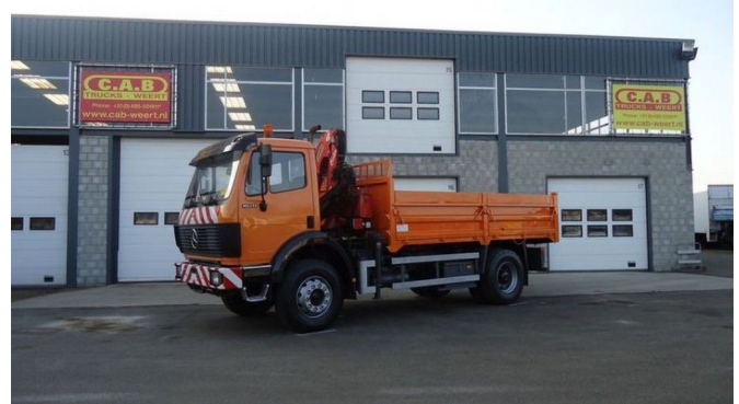
Mercedes-Benz 1820 AK 4x4