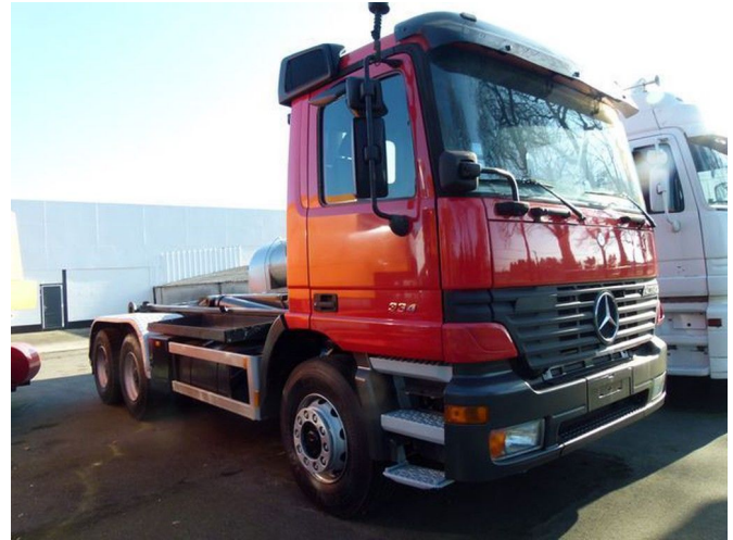
Mercedes-Benz 2640 K Haaksy... 6x4