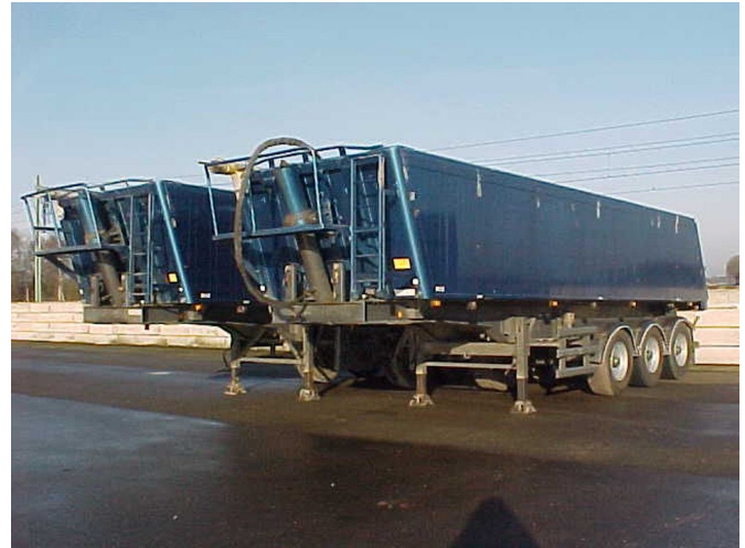
Stas 2 Trailers / Alu - 33M3