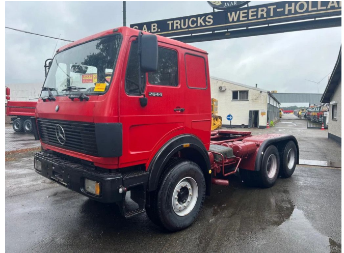
Mercedes-Benz 2644 - V8 6x4