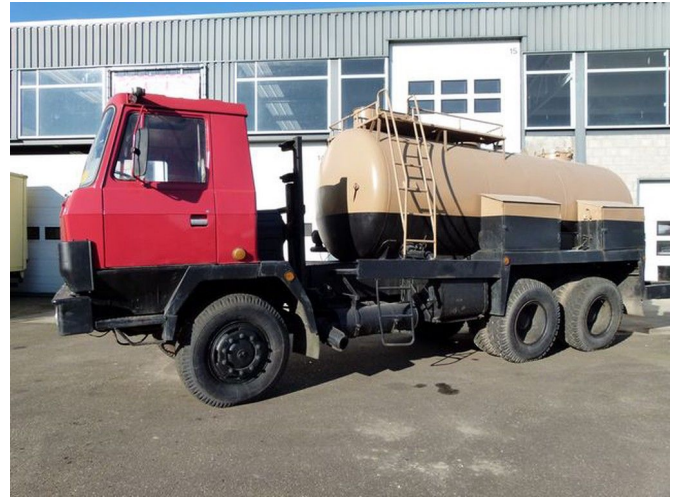
Tatra 815 P 13 - 6x6