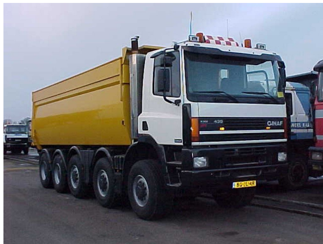
Ginaf M 5450 10x8