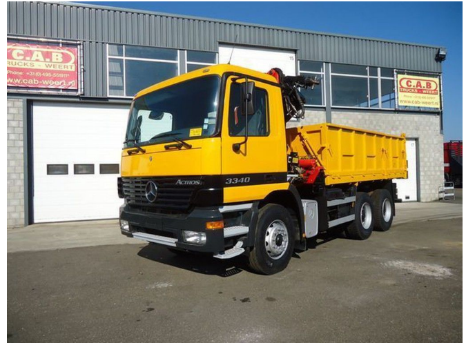
Mercedes-Benz Actros 2640 - 6x4 - ...