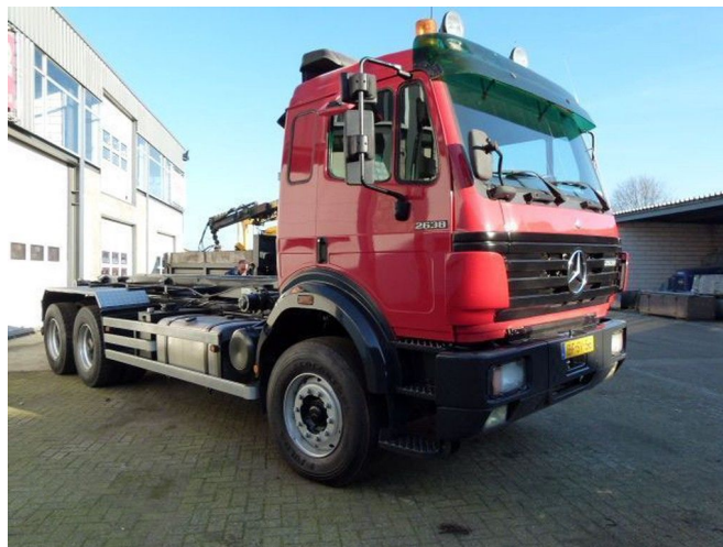
Mercedes-Benz 2638 K / 6x2