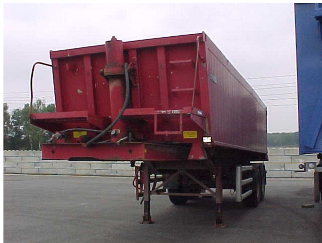
Renders ROC 16.20S - Aluminium