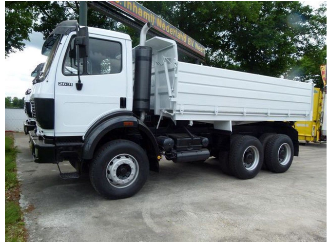
Mercedes-Benz SK 2631 K / 6x4 STEEL SPRINGS