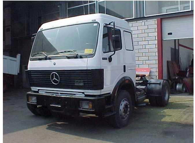
Mercedes-Benz SK 1948 1948 S / 4x2 / V8- EPS with 3 pedals