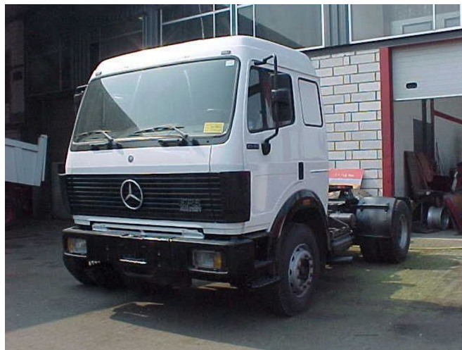
Mercedes-Benz SK 1948 1948 S / 4x2 / V8- EPS with 3 pedals