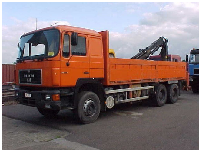
MAN 26.422 6x4 + Crane TIRRE