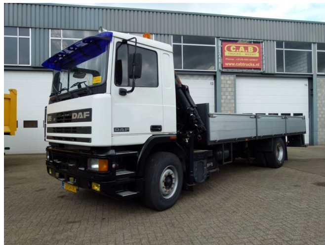
DAF 95.350 - 4x2 - Crane Pesci