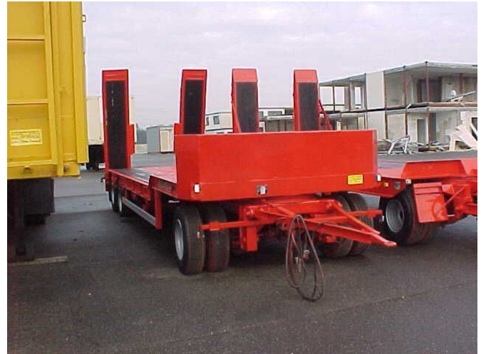
Bertoja Supercondor 30E / 3 axes