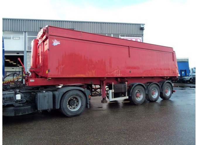
ATM OKA 15/27 - 30M3