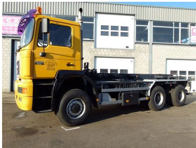
MAN 33.403 33.403 6x6 kettingsysteem