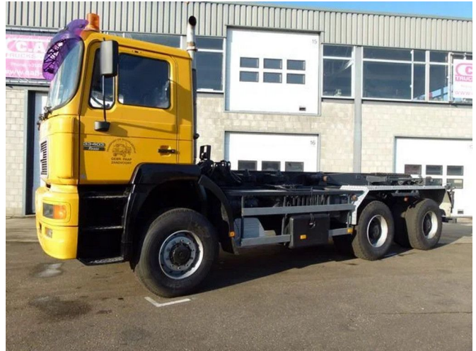
MAN 33.403 33.403 6x6 kettingsysteem