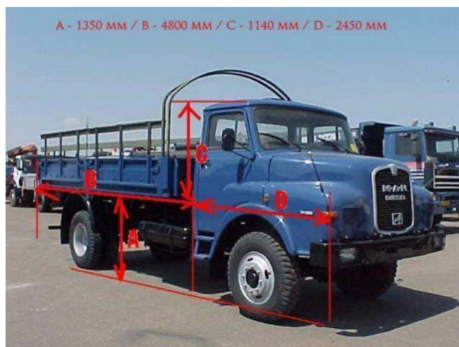
MAN 11.136 - 4x4