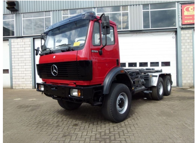
Mercedes-Benz SK 2729 AK - 6x6 - HAAK/HOOK