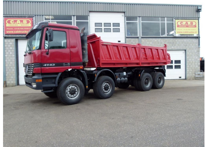
Mercedes-Benz 4143 AK - 8x8 RESERVED - RESERVED