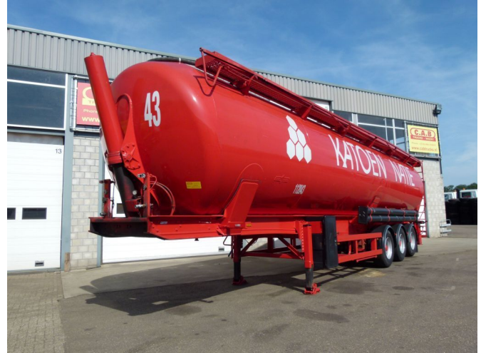
SPITZER EUROVRAC - SK2765CAL - 65M3