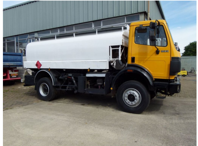
Mercedes-Benz 1824 AK - 4x4 - Fuel tanker