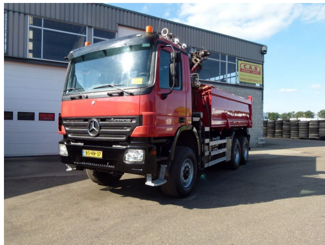
Mercedes-Benz AK 6x6 Steel Springs CRANE TIRRE 131