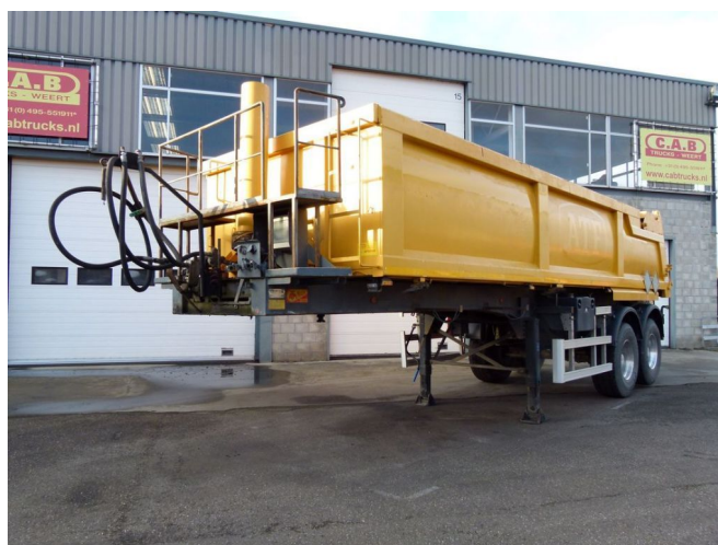
ATM OKHS 18/20