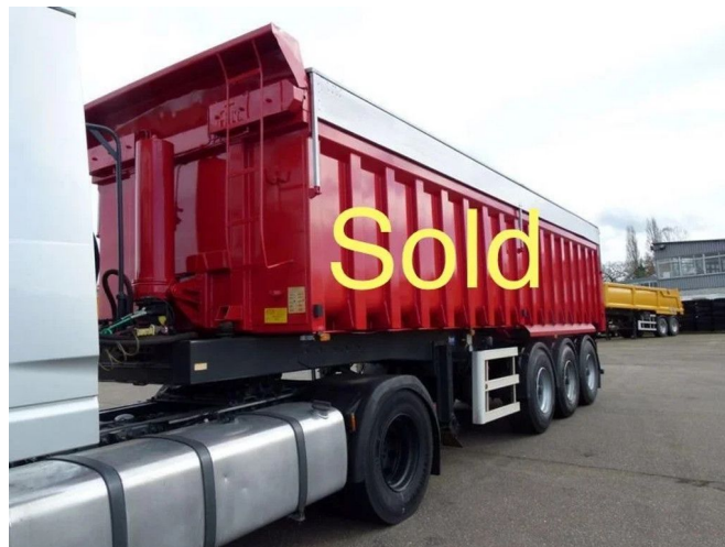
ATM OKA 17/27 SOLD SOLD