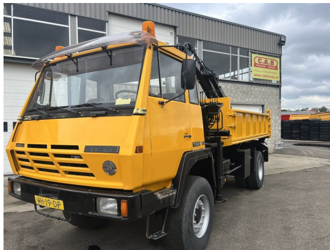
Steyr 19S31 4x4