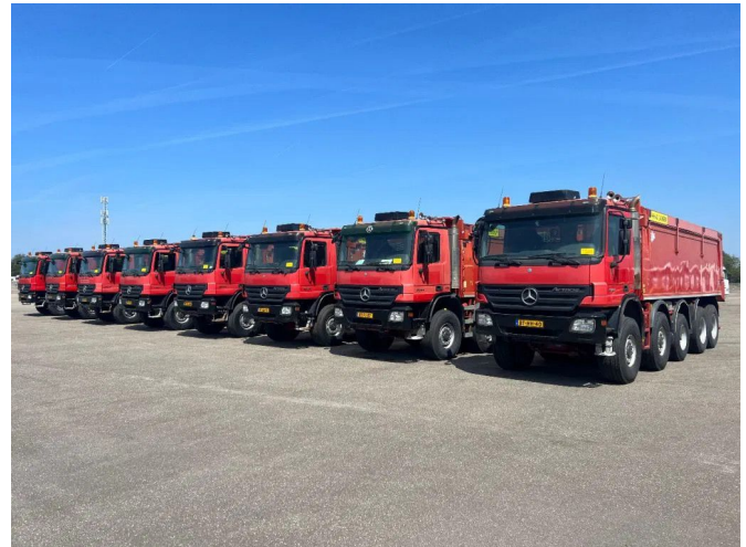
Mercedes-Benz 6 x Mercedes 5044AK10 x 8 /// ... 10x8