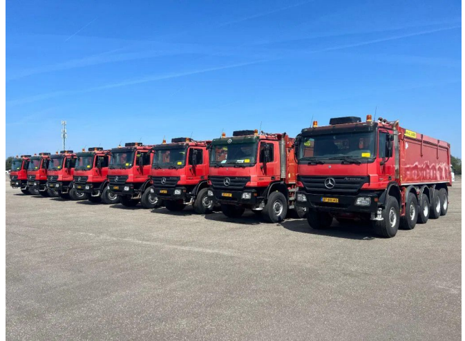
Mercedes-Benz 6 x Mercedes 5044AK10 x 8 /// ... 10x8