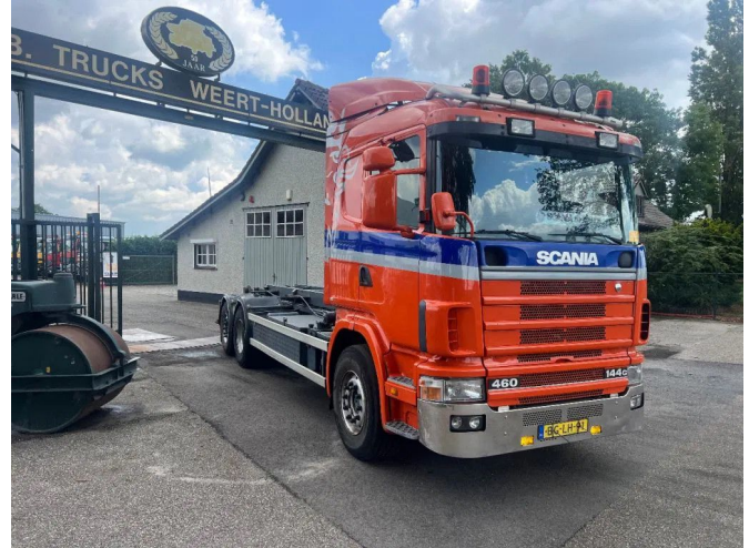
Scania V 8 144.460 MANUAL GEAR RESERVED GER... 6x2 Referentienummer: SC980051