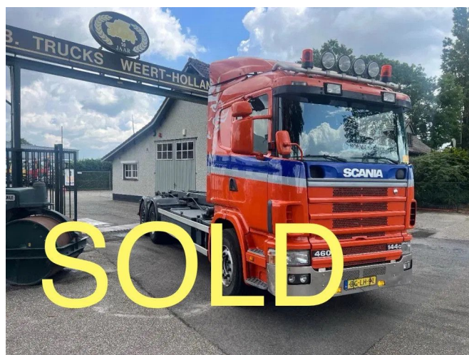
Scania V 8 144.460 MANUAL GEAR - SOLD - VENDU 6x2