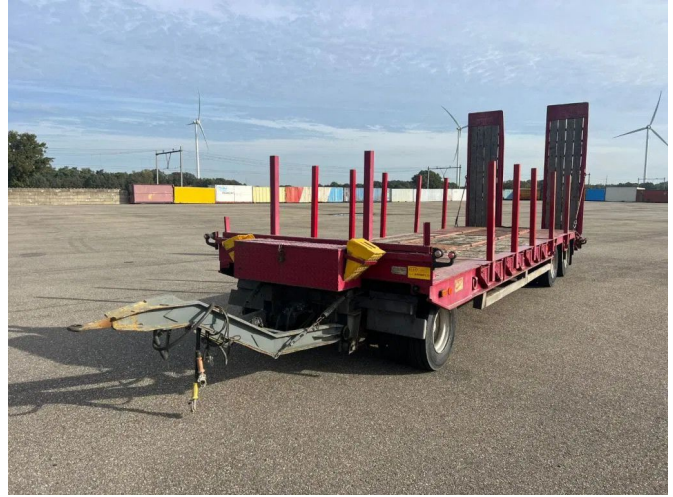
ATM 3 asser bladgeveerd APK t/m 26-2-2026