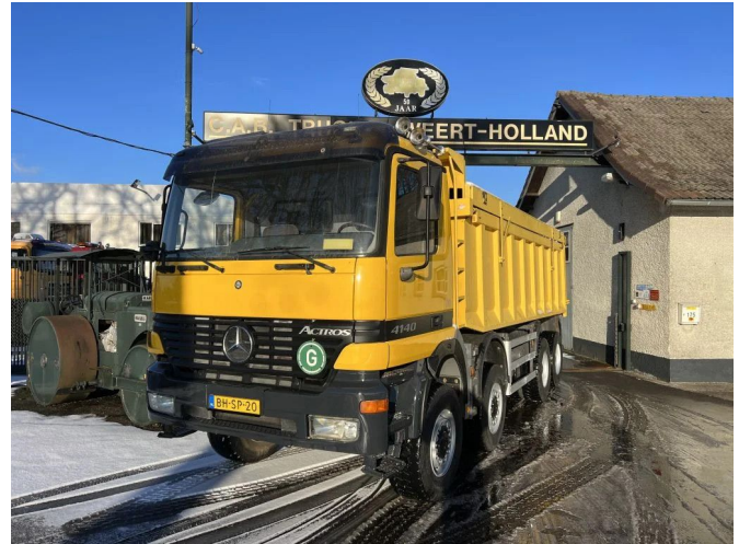
Mercedes-Benz Actros 4140 AK 8x8 Steel Springs - 3 pedals...