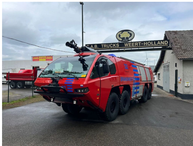
E-ONE CRASHTENDER 8X8 TITAN P6 HPR G-Series