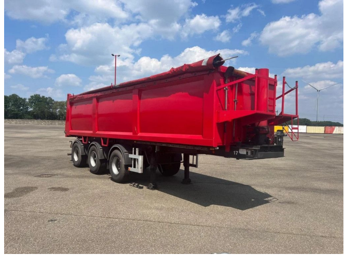
ATM 15-30 met oprolzeil - 2 Assen gestuurd - Liftas