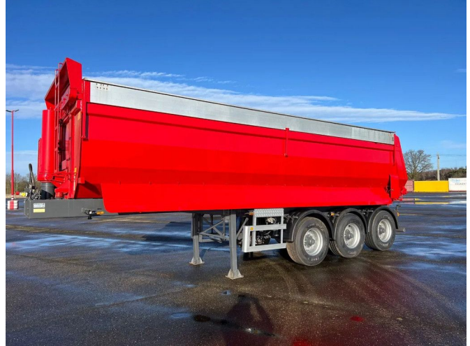
ATM OKA 17/27